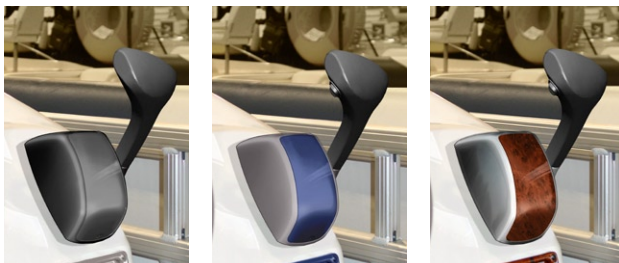
CH7500 With Hydrograph inserts